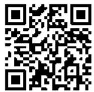
A QR code for the video mentioned in this tip.

A: It is a QR code or Quick Response Code. It is basically a sophisticated 3D barcode. They are showing up in the pages of magazines, websites, the sides of buildings, business cards, and are starting to find their way into education. The easiest way to use them is with a smartphone (eg an iPhone, Android, etc). You need to download a free app for your phone (just search for QR). Once you have that app, you run the app, point your phone's camera at the code and once it is