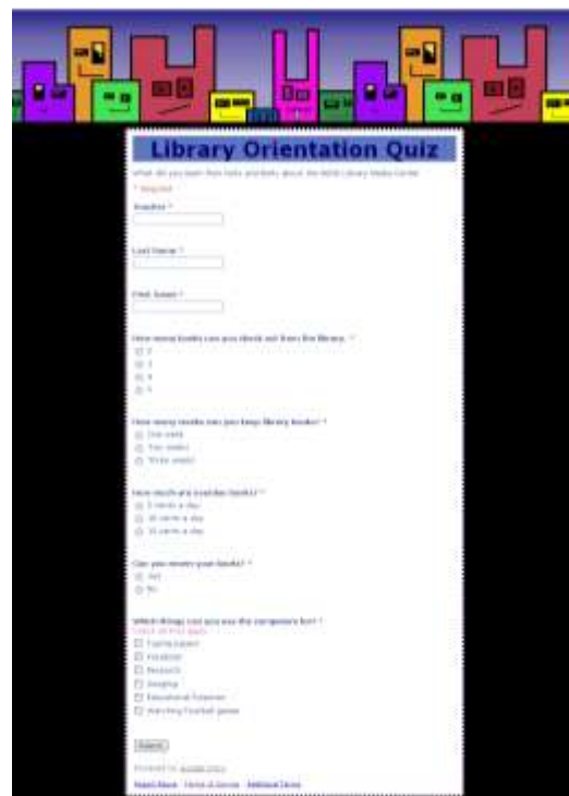
A Self-Checking Quiz for Library Orientation. See it online at: bit.ly/behslibquiz

The topic this month will be creating online surveys and self-correcting quizzes using Google forms. The surveys are just like the ones I've been sending throughout the year and now you can learn how to make them too! They can be used to collect responses from students, check for understanding, check student progress, or as a final test.